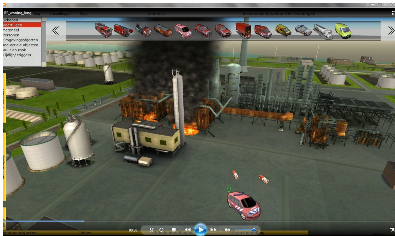
Screenshot from Rescuesim by VSTEP