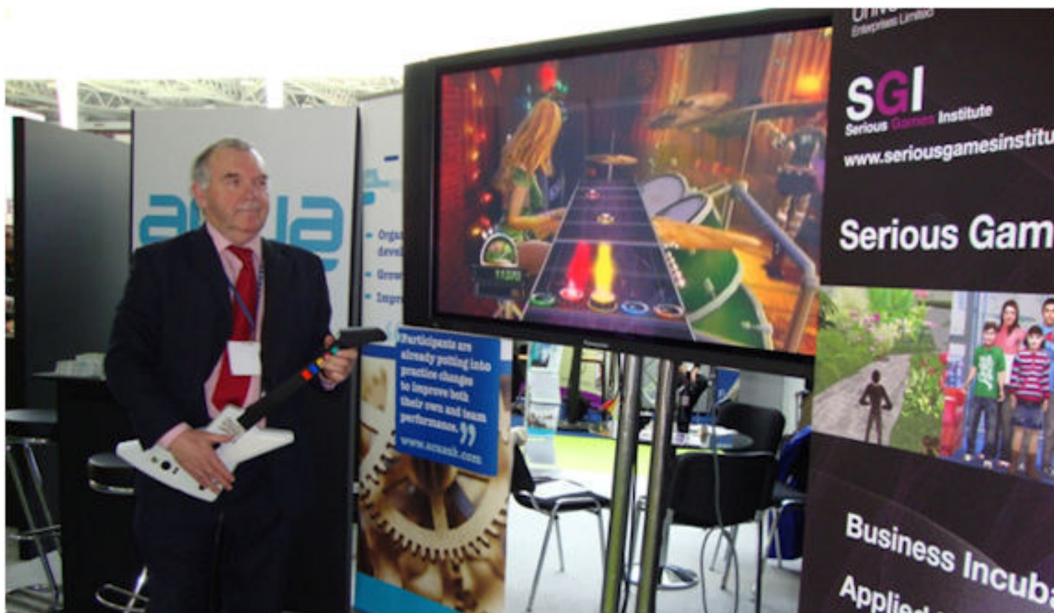
SGI / Relate stand at HRD Olympia

On April 22 nd – 23 rd the SGI shared an exhibition stand with the Relate organisation at the HRD conference and exhibition as well as speaking on the future of making a presentation on “The Challenge of the Digital Native Generation” in one of the workshops. The exhibition stand was also supported by TPLD who specialise in immersive collaboration and learning spaces.