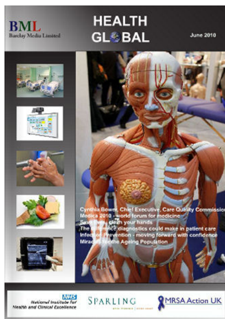
Health Global June Edition

On June 16 th an article “Miracles for the Ageing Population” was published in the Health Global electronic publication. This questioned some of the current approaches to using technology to support independent living. You can view the article on pages 68-69 by clicking on the link below :-